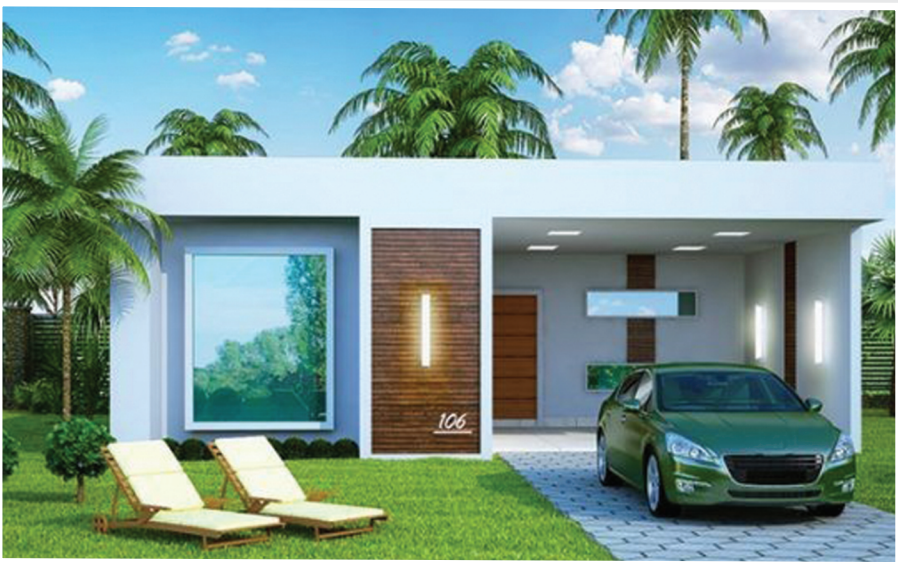
360 INDEPENDENT HOUSES