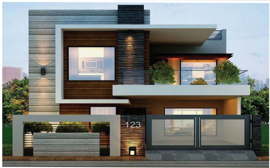
75 LUXURIES VILLAS